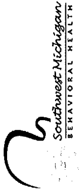
SWMBH 04.09A MAT Guidelines Acuity and Intensity Table